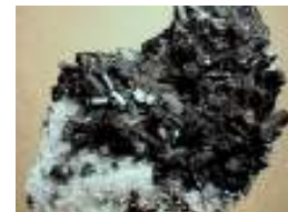
Arsenopyrite Quiruvilca, La Libertad, Peru