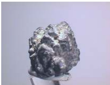
Arsenic Akadanimura, Echizen Province, Japan

Orpiment (Arsenic Sulfide) is a rare mineral that usually forms with realgar. In fact the two minerals are almost always together.