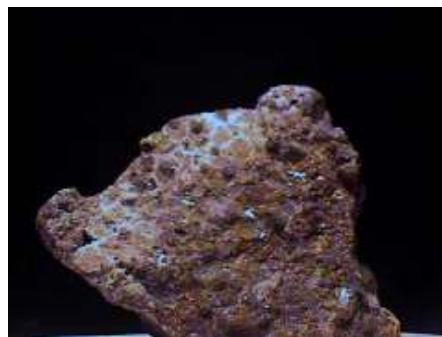
Arsenic (Kuse Mine, near Bau, Sarawak, Borneo)

Cadmium , a soft, malleable, ductile, bluish-white metal, was discovered in Germany in 1817. Germany also remained the only important producer for 100 years. Currently, a large percentage of the global cadmium metal production takes place in Asia. Cadmium is generally recovered as a by-product from zinc concentrates. The Zinc to Cadmium ratios in typical zinc ores range from 200:1 to 400:1. Sphalerite, commonly contains small amounts of other elements, including cadmium, which happens to share similar chemical properties with zinc, and will substitute for zinc in the sphalerite crystal lattice. The resulting cadmium mineral, Greenockite (CdS), is associated with weathered Sphalerites and Wurtzites. Most of the cadmium is recovered from spent nickel cadmium batteries.