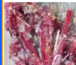
Cinnabar Culver Baer mine, Sonoma County, Calif.