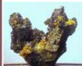
Orpiment Twin Creeks Mine, Humboldt County, Nevada