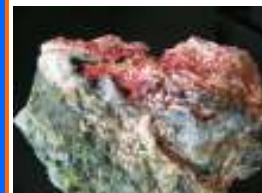
Cinnabar Clear Creek Mine, San Benito County, California