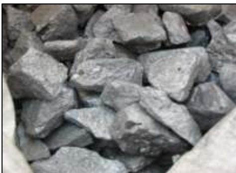
(2) Ferro Silicon (Tian Jin, China)

you consider that 25% of the Earth's crust has silicon in it. Silicon binds strongly with oxygen and is usually found as silicon dioxide (quartz) or as a Silicate ( \text{SiO}_4 ). Native Silicon has been found in volcanic exhalations (emissions) and sometimes as tiny inclusions in gold. Silicon can be found in rock shops as end fragments of silicon boules, discarded by the integrated circuit industry. The unused parts of the boules are often saved, and used as decorative items.