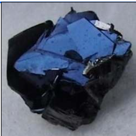
(1) Covellite (Butte, Montana)

Silicon (2) is rarely found in nature in an uncombined form which is amazing when