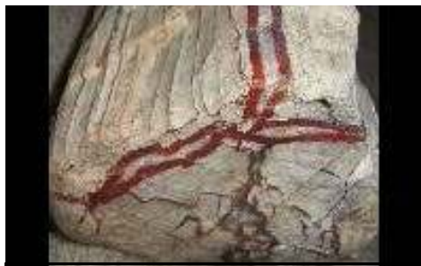
Red Petrified wood (Lane Co, Oregon)

The term “fossilization” refers to a variety of equally complex processes that enable the preservation of organic remains within rocks. It frequently includes the following conditions: rapid and permanent burial/entombment; protecting the specimen from environmental or biological disturbance; oxygen deprivation; limiting the extent of decay and also biological activity/scavenging; continued sediment accumulation as opposed to an eroding surface; ensuring the organism remains buried in the long-term; and the absence of excessive heating or compression which might otherwise destroy it.