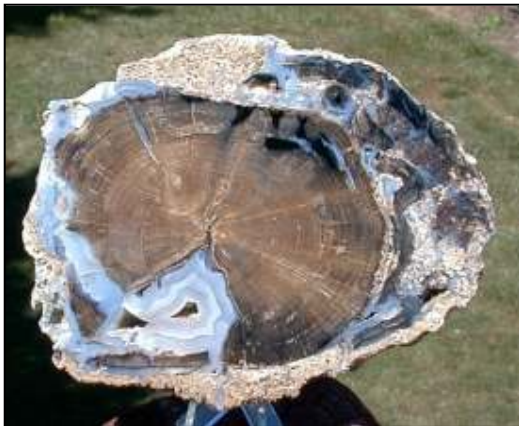
Blue Forest Petrified Wood (Wyoming)