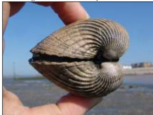
Venerior bivalve (Bracklesham Bay, West Sussex, UK)

The term “fossilization” refers to a variety of equally complex processes that enable the preservation of organic remains within rocks. It frequently includes the following conditions: rapid and permanent burial/entombment; protecting the specimen from environmental or biological disturbance; oxygen deprivation; limiting the extent of decay and also biological activity/scavenging; continued sediment accumulation as opposed to an eroding surface; ensuring the organism remains buried in the long-term; and the absence of excessive heating or compression which might otherwise destroy it.