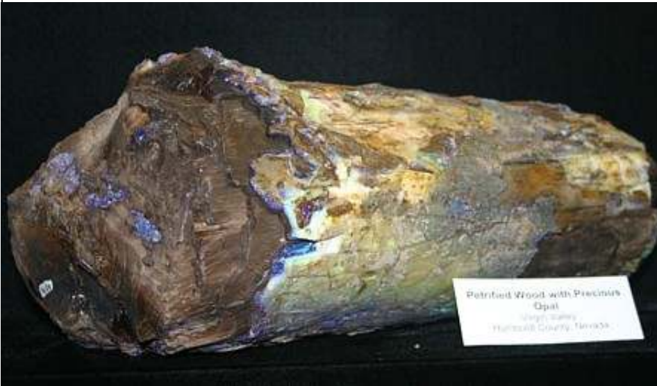
Opalized wood (Virgin Valley, Nevada)

P.O. Box 23020 Honolulu, HI 96823-3020