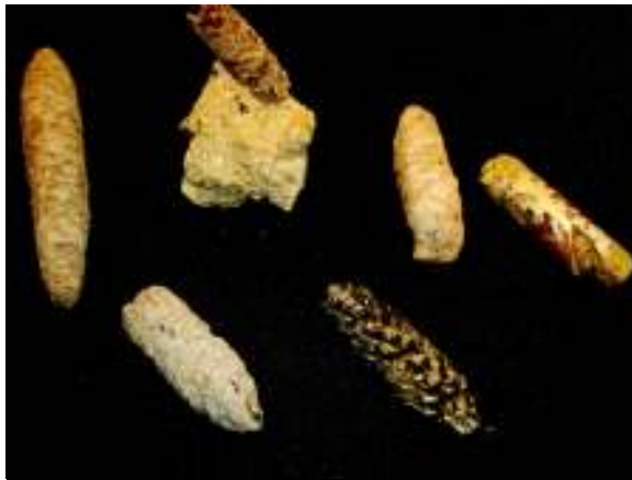
Opalized pinecones (Virgin Valley, Nevada)

From that a fossil is any evidence of life that has been preserved in rock. Fossils include not just organisms themselves, but also the burrows, marks and footprints they left behind. Fossilization is the name for the processes that produce fossils. One of those processes is mineral replacement. This is common in sedimentary rocks and sometimes with metamorphic rocks, where a mineral grain may be replaced by material with a different composition, but still preserving the original shape.