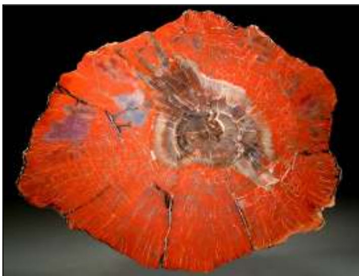
The petrified wood from Arizona is renowned for its reds and yellows due to the naturally radioactive soil.

The process of petrification (of wood) starts with three basic ingredients: Wood, water and mud. Ancient logs or branches fell to the ground, which was then swept into a waterway. This tumbled downstream through lakes or swamps, where they eventually came to rest buried under water, debris, and mud—the mud, here, being volcanic ash. The water and mud stop oxygen from contacting the logs, so that the logs do not decompose; instead the mud slowly releases minerals into the water, which seep into the wood and form into quartz crystals. Over many millenniums the quartz crystals continue to grow replacing more and more wood till the entire log is turned into stone.