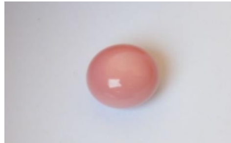
Worlds largest Melo Pearl (37.6 mm and 397 cts)