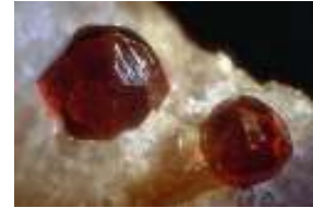
(2) Almandine Fanny Gorge Mine, Spruce Pine, NC

Rhodonite is an attractive mineral that is often carved and used in Jewelry. It is a Manganese Iron Magnesium Calcium Silicate and named after the Greek work for rose, Rhodon. Its rose-pink color is distinctive and can only be confused with rhodochrosite. Rhodonite does not react to acids and