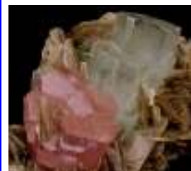
(5) Pink Fluorapatite, Aquamarine on Muscovite Nagar area, Gilgit district, Pakistan