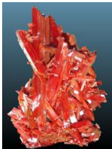
(1) Crocoite Adelaide Mine, Dundas, Tasmania

Almandine , is the most common of the garnets, this Iron Aluminum Silicate, is usually found in garnet schists (metamorphic rock composed mostly of mica). Transparent crystals are frequently cut into gemstones.