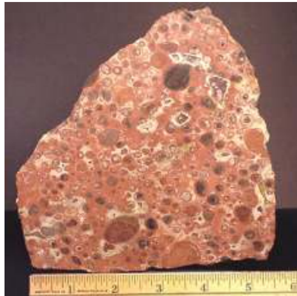
(4)Bauxite (Saline Co, Arkansas)

The largest producers of aluminum metal are Russia, China, the United States, and Canada, which are countries that have abundant hydroelectric power. Recycling of aluminum by melting cans and other products is an important source of metal in many developed countries.