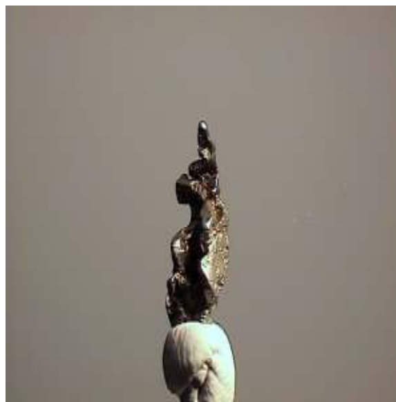
(3)Platinum (Kunder Massif, Russia)

Natural Platinum is fairly impure. It is always associated with small amounts of other elements, such as gold, copper, nickel, and iron, and many times contains the rare heavy metals iridium, osmium, rhodium, and palladium. Platinum is a precious metal used in jewelry as ring settings, bracelets, and necklaces. Platinum also has a number of industrial uses due to its other special properties. The most famous is its use as a catalyst (anti-pollution device), found in car mufflers. It is also used for numerous laboratory apparatuses and as dental fillings.