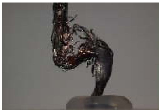
2) Silver (Keenly-Frontier Mine, Lorrain Township, Ontario, Canada)

Silver also has many unique physical properties. Silver is a very good conductor of electricity, is the second most malleable and ductile metal, and is in greater abundance than all other precious metals with similar properties. Silver is largely used as jewelry, ornaments, and coins. It is very easy to work with, and many objects are created from it such as goblets, candelabras, trays, and cutlery. In the industrial sector, silver is widely used for electrical apparatuses and circuits. It is also used for medicinal purposes, particularly in dentistry, for bactericides, and for antiseptics