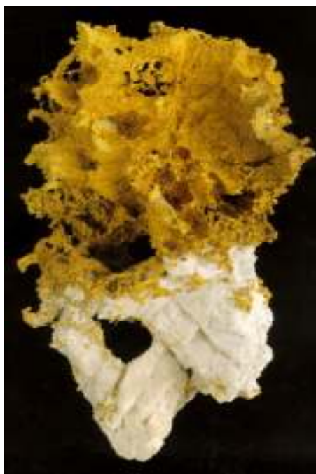
(1) Gold “The Whopper” (Sixteen to One Mine, Alleghany, California)

stance known. It can be flattened out to less than 0.00001 of an inch and a 1 oz. (28 gram) mass can stretch out to a distance of over 50 miles. Gold is also one of the most resistant metals. It won't tarnish, discolor, crumble, or be affected by most solvents. This malleability and ease of working the metal, has made gold the metal of choice for ornaments. Especially noteworthy are the golden ornaments from the tombs of the Pharaohs in Egypt, where gold masks, statues, coins, and jewelry was archeologically excavated. Along with jewelry, gold has been also been used for coinage throughout the centuries, and is currently accepted internationally as a standard value.