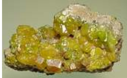
Mimetite Elura Mine, Booroondarra, Cobar, Robinson Co., New South Wales, Australia