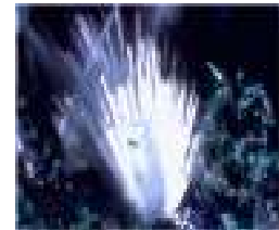
Dundasite Tsumeb mine, Tsumeb, Namibia