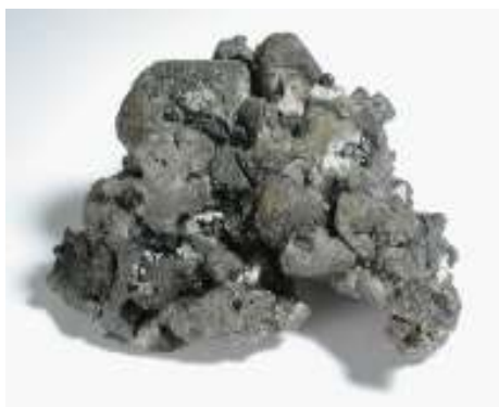
Lead Langban, Filipstad, Varmland, Sweden

Anglesite (Lead Sulfate) is named after the locality that it was found. Pary's Mine on the island of Anglesey in Wales, UK. Anglesite can be white to colorless with thick tabular crystals.