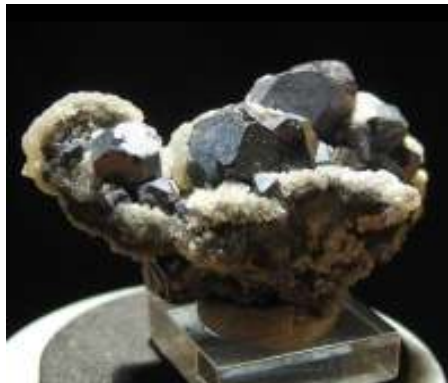
Galena Shaoguan Prefecture, Guangdong Province, China