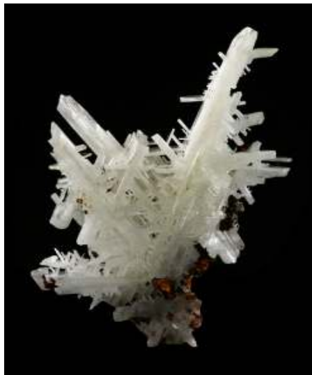
Cerussite Daoping Mine, Gongcheng Co, Guilin Prefecture, Guangxi Zhuang Region, China