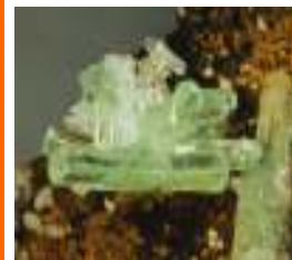
Anglesite Montevecchio Mine, Arbus, Mendio Campidano Province, Sardinia, Italy