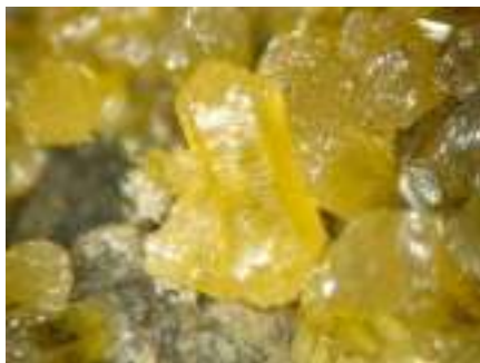
Mimetite Challacollo, Iquique Province, Tarapaca Region, Chile

Mimetite (Lead Chloro-arsenate), named in 1835 from the Greek word for "Imitator", which is an allusion to its resemblance to Pyromorphite. Mimetite is a secondary mineral found in the oxidized zones of lead deposits. Mimetite is usually found as small hexagonal prisms, with a color ranging from pale yellow, to yellowish-brown, yellowish-orange, orange-red, greenish, white and colorless.