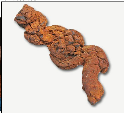
(2) Coprolite, (fossilized turtle doo doo),