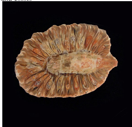
(9) Fossilized Pine Cone, Patagonia, Argentina

Petrified Pine Cones (9), especially ones from the Patagonia area of Argentina are renowned for their incredible details and colors