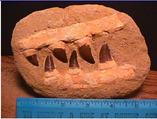
(3) Mosasaur Jaw Section, Atlas Mountains, Morocco