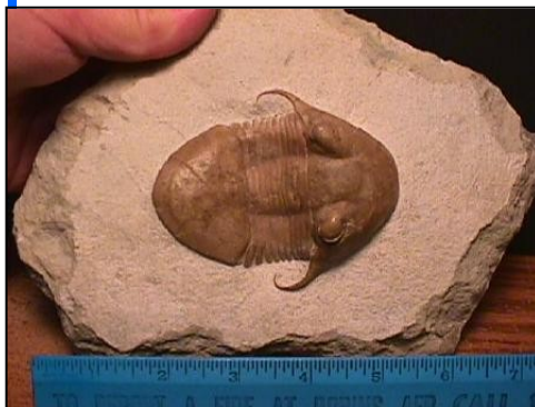
(1) Russian Trilobite, Wolchow River Basin, Russia