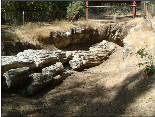
(1) petrified coastal redwood tree

Calistoga, California, a town known more for the bottled water, is also home to a couple of California's natural wonders, the first being California's Petrified Forest. In the hillsides west of Calistoga, conditions were just right so that when the giant Redwoods collapsed, they were covered in ash, preventing them from decaying. Instead, the logs slowly mineralized and later agatized. There is a short trail of a mile in length which will take one through the excavated areas where the giant petrified logs have been excavated. Most of the logs are coastal Redwoods (1), with one lone petrified pine tree (2). The "Robert Louis Stevenson" tree fossilized to such degree that one can actually count the rings on the tree.