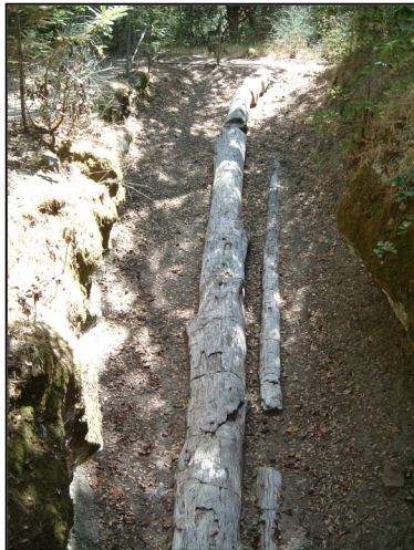
(2) petrified pine tree 42' long 2' diameter

Five miles from The Petrified Forest, you will find the "Old Faithful of the West" (3). This is a natural geyser which erupts every 40 minutes or so. Each eruption last about 10 minutes, so there is not a very long wait for the next one.