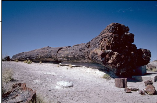
(8) Petrified Wood "Old Faithful", Petrified Forest, Arizona 9.5' in diameter!

The best place to go to see these logs, and I do mean petrified logs, and not petrified wood, is Petrified Forest National Park, located in eastern Arizona (8). This place is loaded with petrified logs and the remnants of logs where earlier folks blasted apart the logs to get to the Amethyst Crystals which were within the logs.