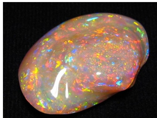
(4) Opalised Clam Shell, Cooper Pedy, Australia

It is not to say that all of the fossils are sacred to us. In the lapidary world we highly prize fossils. Some of the most brilliant opals have come from cutting opalized clam shells(4) into jewelry.