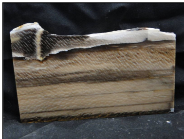
(6) Petrified Sycamore Wood

Similarly, petrified wood is found throughout the country, and actually throughout the world (5). Most of the petrified wood one finds are brown, black, tan, or some shade thereof (6). The petrified wood from Arizona is highly prized, as it is some of the most colorful wood in the world (7). The reds come from iron rich jasper. The yellow from uranium salts. The black is from manganese oxides. Additionally, there are Amethyst vugs within the petrified logs.