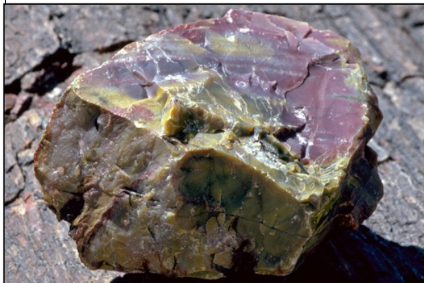
(7) Arizona Petrified Wood

The best place to go to see these logs, and I do mean petrified logs, and not petrified wood, is Petrified Forest National Park, located in eastern Arizona (8). This place is loaded with petrified logs and the remnants of logs where earlier folks blasted apart the logs to get to the Amethyst Crystals which were within the logs.